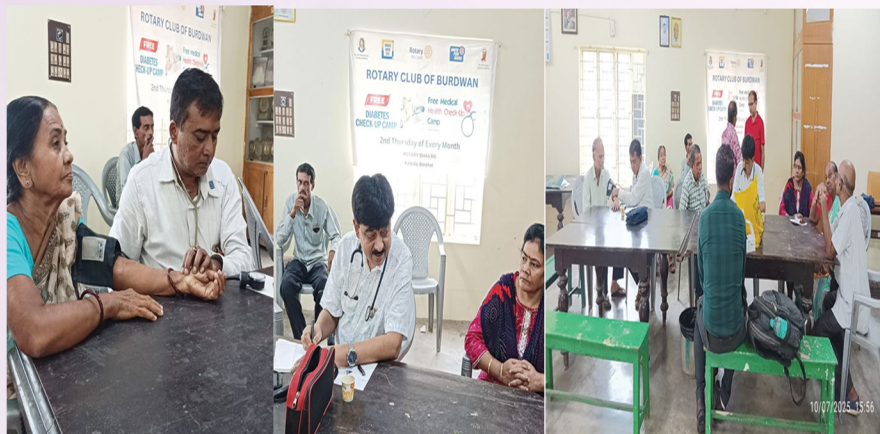
Diabetes camp 2nd Thersday of every Month